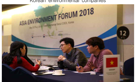
2018 Asia Environment Forum