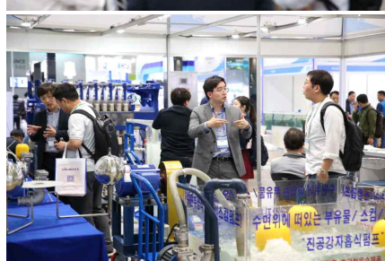
Exhibitors and Visitors of ENVEX2018